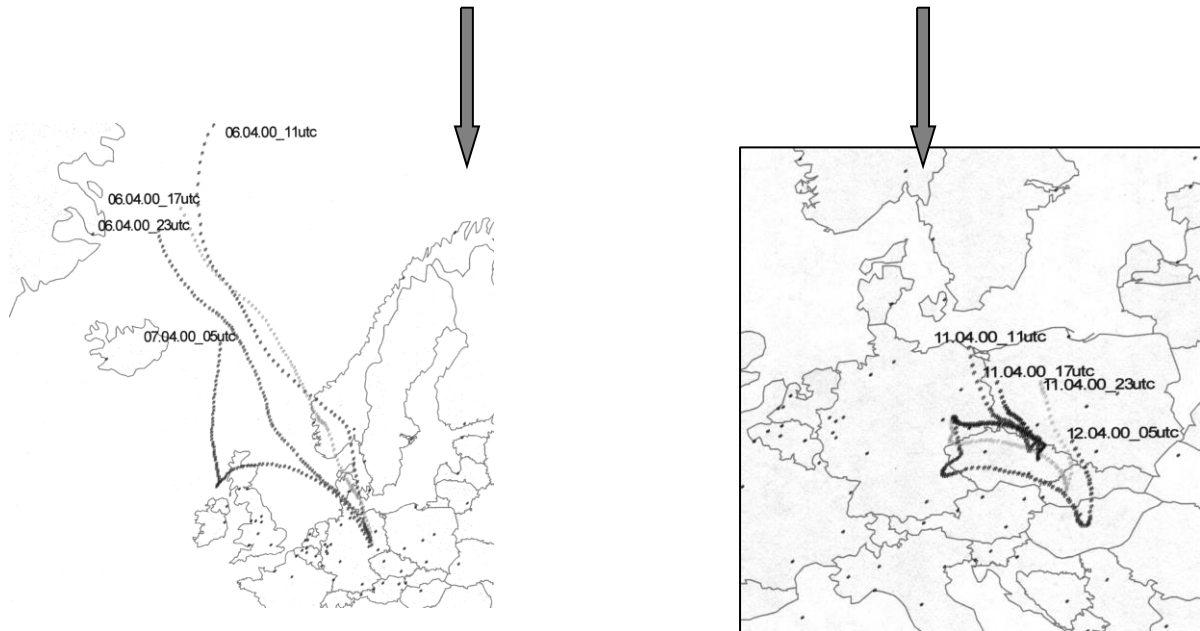
Figure 3: Daily PM 1 filter samples (LF) and exemplary back trajectories for two days