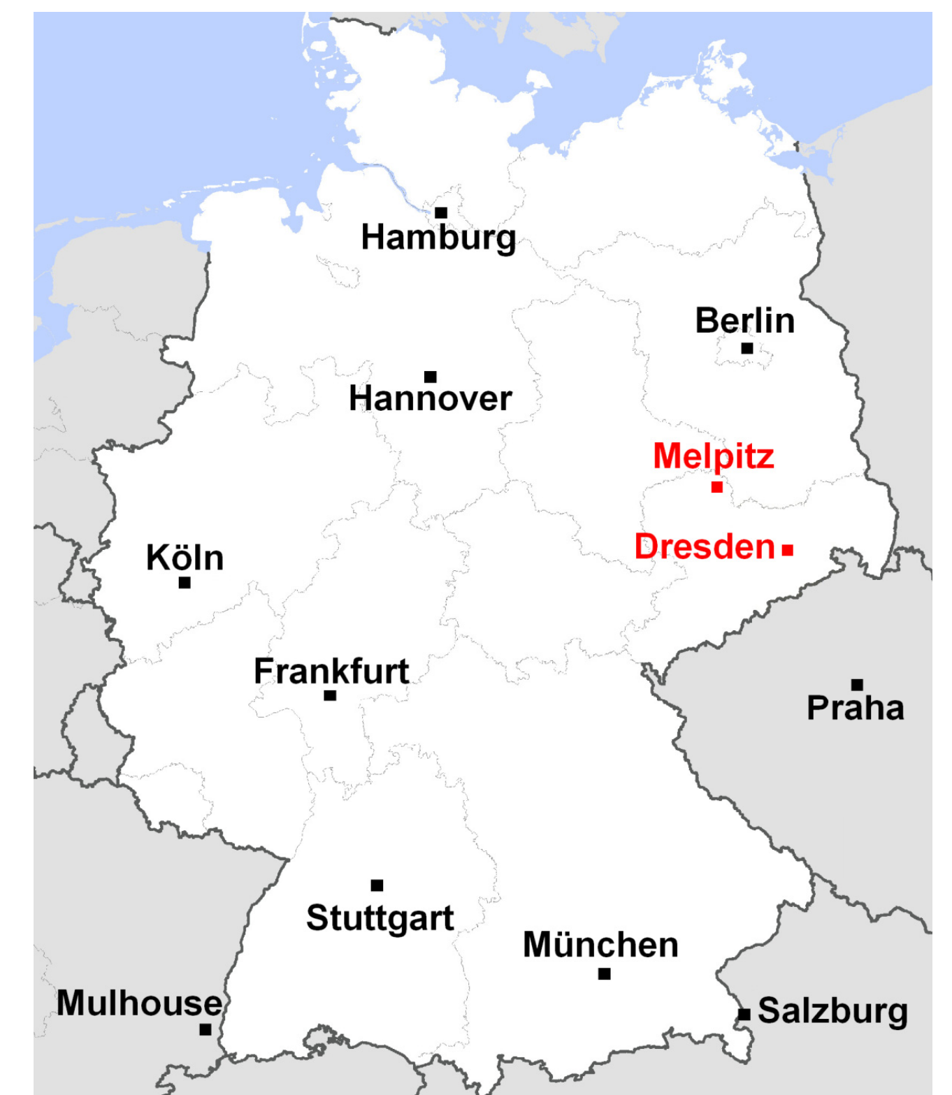
Fig. 1: Location of the sampling sites in Germany (shown in red).

A measurement is started using weather forecasts, as a constant air mass origin and dry weather conditions are needed during the 24 hour sampling period. The sampled air volume is 108 m 3 in each case. Aerosol samples are analysed for mass, main ions (sulfate, nitrate, chloride, ammonium, sodium, potassium, magnesium, calcium), organic carbon, elementary carbon and various single organic compounds such as long-chain n-alkanes and PAHs.